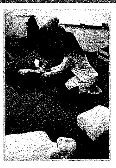
First Aid/CPR training offered at the Library.