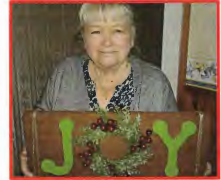
The Seniors Aging Well "JOY" sign workshop was perfect.