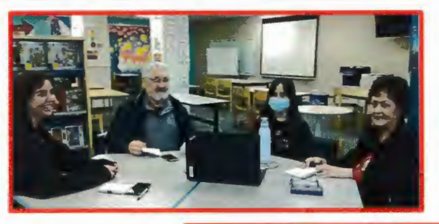
EPL's Tech Tutor Team helping patrons learn new computer skills.